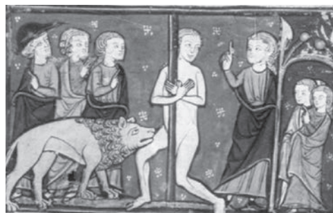
London, Westminster Abbey MS 22, fol. 16r.

articles that wander across frontiers: articles that focus on meetings between cultures, that pursue an idea through the centuries, that employ the methods of different disciplines simultaneously. Articles must attain technical excellence while remaining accessible to the interested non-specialist.