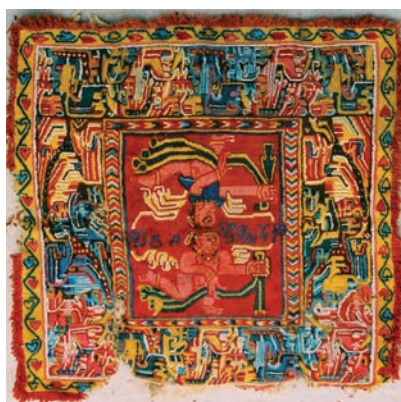
Fifth-late sixth/early seventh century CE. Lop, Khotan, Xinjiang, China. Knotted wool; 123 x 119 cm. Police Department, Lop County.

The Journal of Inner Asian Art and Archaeology is a journal launched by the Circle of Inner Asian Art, replacing its Newsletter (Issues 1-20, 1995-2005), which has become a major forum for discussion and publication of current international research projects and fieldwork concerning the art and archaeology of Central and Inner Asia. Uniquely the journal covers the vast regions flanking the ancient Silk Roads from the Iranian world to western China and from the Russian steppes to north-western India. The journal mainly focuses on the pre-Islamic and early Islamic art and archaeology of Inner Asia, as well as its languages, religions and history.